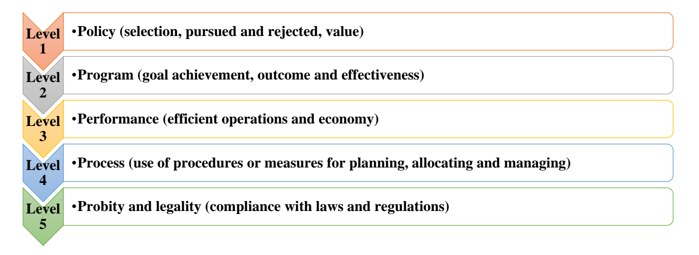
Figure 1: Assignment of Programme Officers (Adapted from Brady & Brady, 2001, p. 11)

Brady and Brady (2001) noted the importance of a fixed assets management program to the disposal process. In establishing a fixed asset management program, officers must be assigned to specific responsibilities to ensure accountability throughout the process at different levels. This is shown in Figure 1.