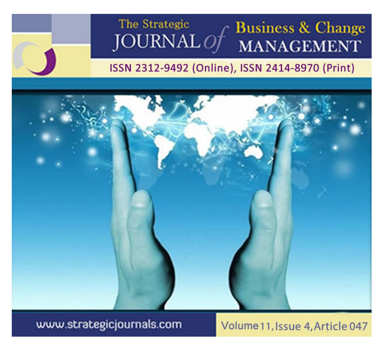
PERFORMANCE APPRAISAL STRATEGIES AND PERFORMANCE OF EMPLOYEES IN HEALTH SECTOR IN EMBU COUNTY, KENYA